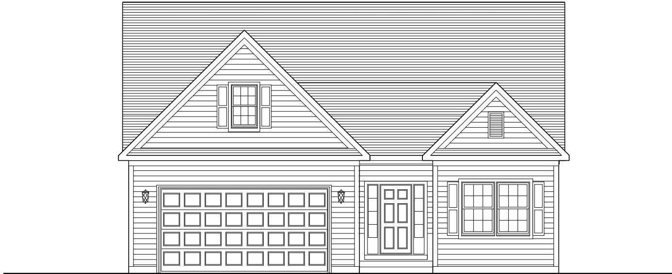
ELEVATION A - REVERSE