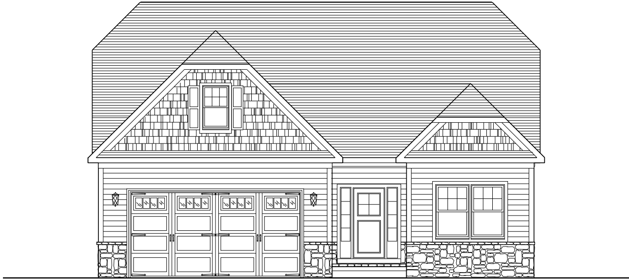
ELEVATION B - REVERSE